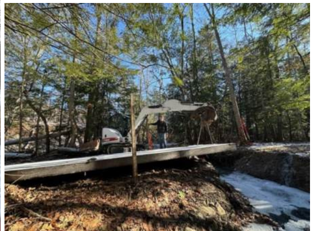
Frontier Sno Riders