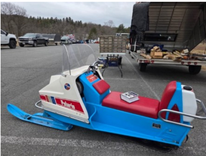
Continued on page 6