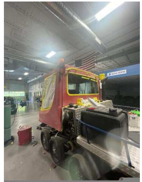
PB100 is nearly ready for new paint at BOCES.