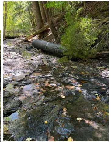
Numerous culverts were washed out during the summer and need replacement.