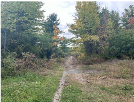
Widened trail at Thacher Park, photo by Matt Lord.