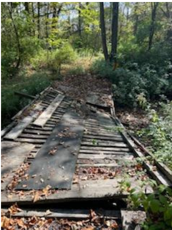
Collapsed bridge on Montgomery club trail #456 on Calovic property requires replacement frame.