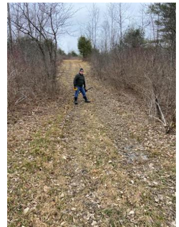
Andy Fielding helping sign trail S72.