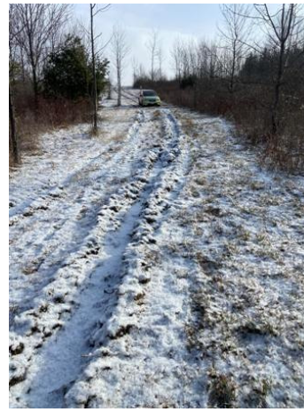
High up on trail to Thacher Park, signing.

Note: many locations will overlap coverage.