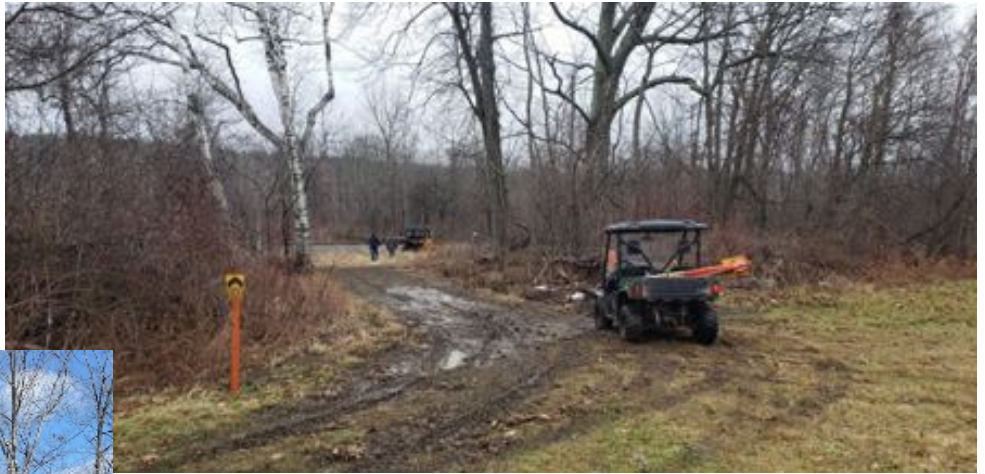
Above, West Rd, Knox