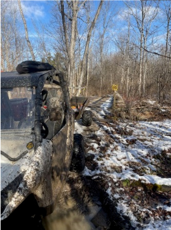
Below, Charleston/ Esperance area.