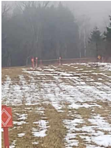
Near Elm Drive, East Berne.

New landowner on Lake Rd/Harden Rd in Mariaville wants people to stay off his private trails this year and please keep to the snowmobile trail. There have been private trail signs placed at his trail openings. Old trail through Mariaville Peat will be used again, so we do not have to go down the side of Route 159.