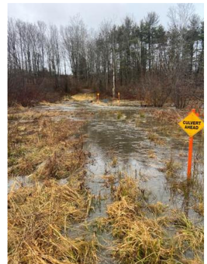
Off of Sawmill Rd, flooded section near start of S72 re-route. Continued next page.