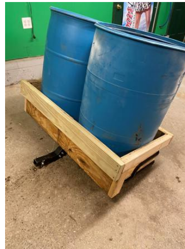
Trail sign carrying rig, attaches to side by side.

PB100 requires a deep cleaning in the cab due to rodent infestation. Chad Saddlemire volunteered to take on the job.