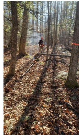
Chainsaw work on S72 in East Berne.