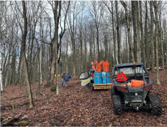
Blue plastic barrels make great sign holding containers.