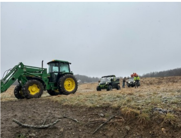
Heavy equipment makes work easier.