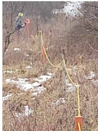
Roping trail near Elm Drive.