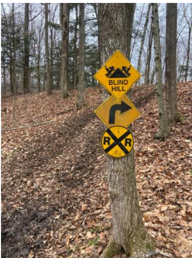
Watch for the train crossing!