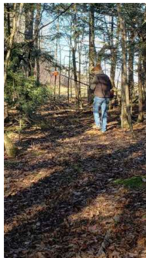
Pole saw work.