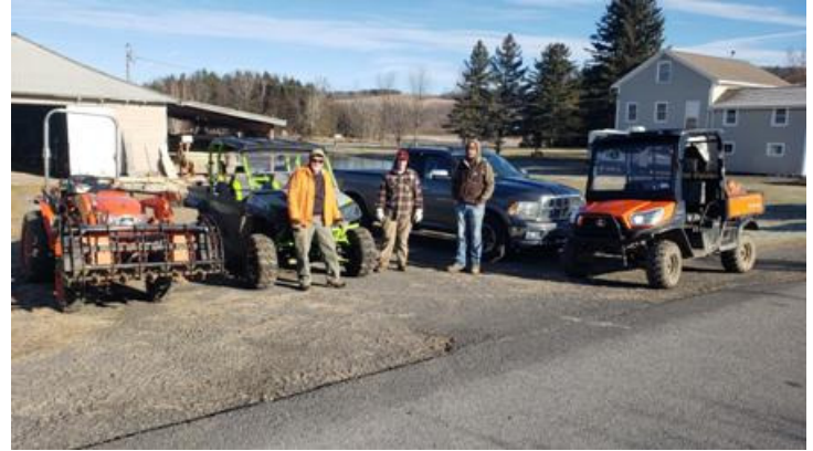
Group picture of men and equipment during one of many work parties held.