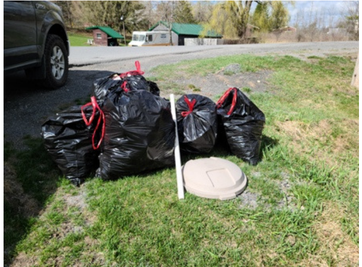
The East Berne Adopt A Highway, spring addition. 8 members helped cleanup the Rt443 roadside.