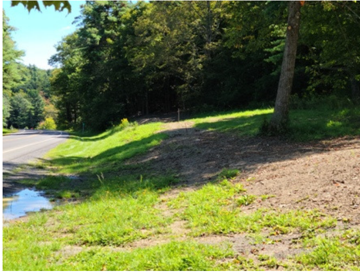
The trail will run here in the future.