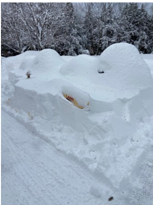
A frosty photo to chill you!