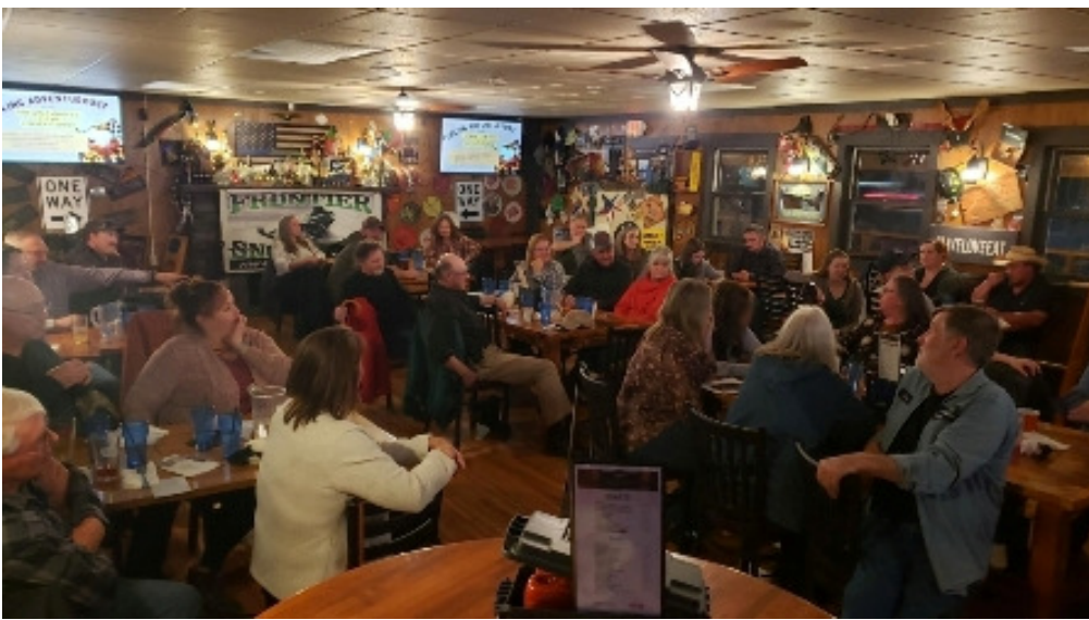
Club members enjoy an evening for their service to the Club.

The executive officers, board, and club members of the Frontier Sno Riders wrapped up the 2022-2023 season with a dinner at the Babbling Brook in Berne on April 26.