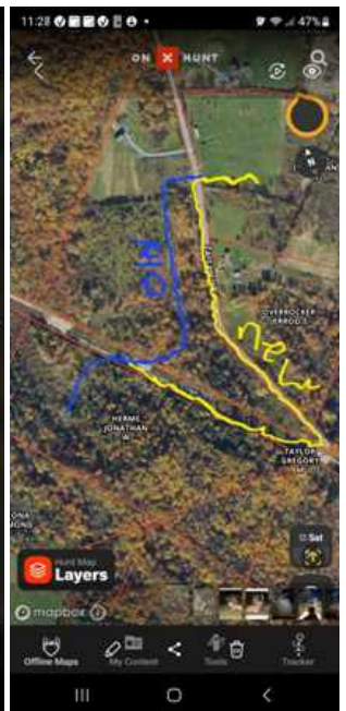
Two sections of C7E have new routing. The maps show the new route in yellow and the old in blue.