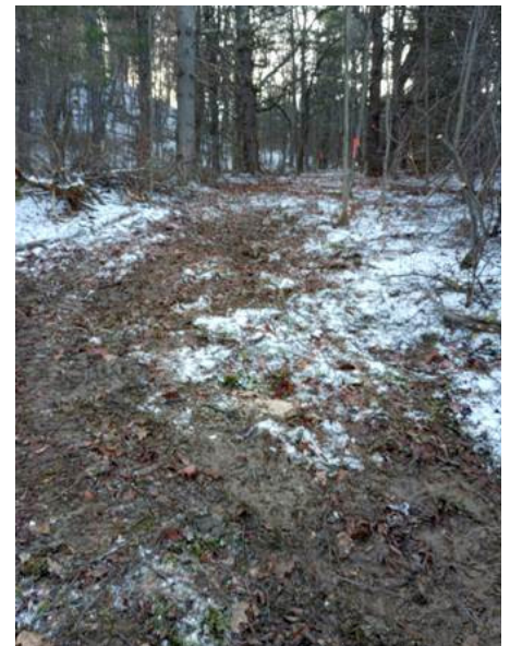
Middleburgh Ridge Runners cut a new section of trail C7B on Cole Hill. This is to go around a section that was a little sketchy.