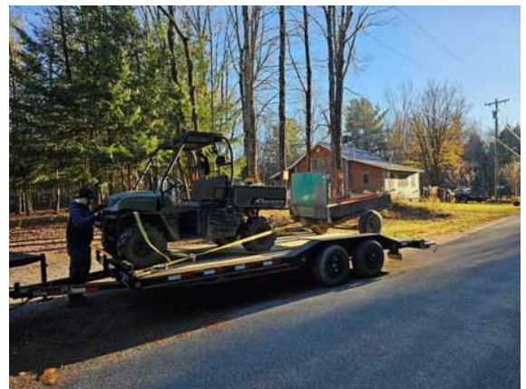
Hauling the 700XP to the trail head.