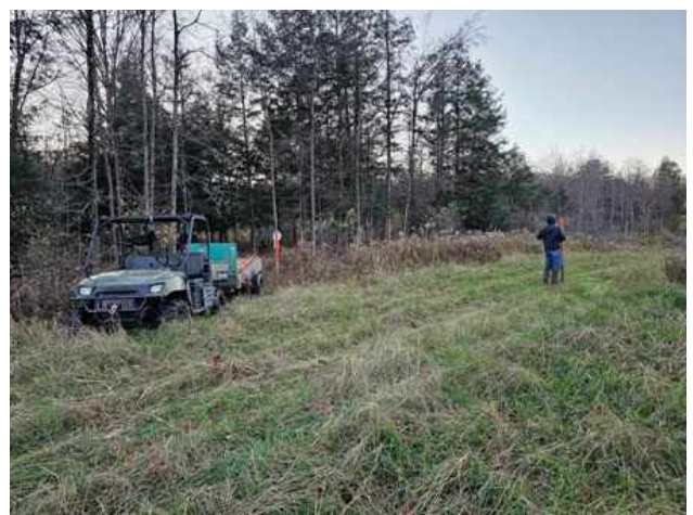
Yancey's new trail work horse, Polaris 700XP, is very helpful for putting up trail signs and posts.

Club Meeting December 13th 6pm The Landing On 20 Duanesburg