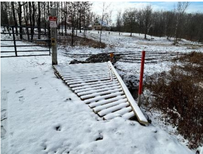
The new bridge built alongside Lake Connection Rd.