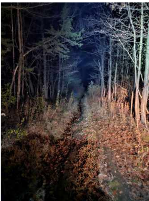
Night time trail work reduces the impact on daytime hunting.