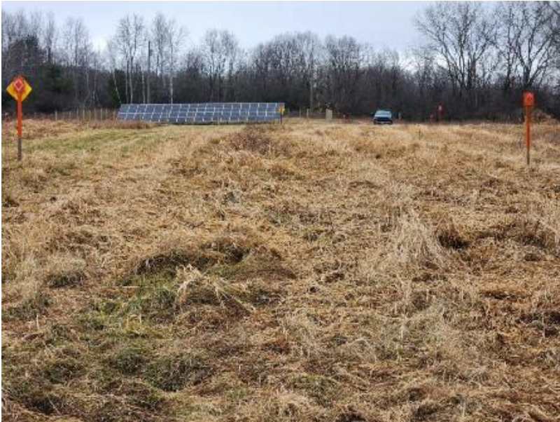
Slight reroute around the town's new solar array. Use caution and follow signs carefully.