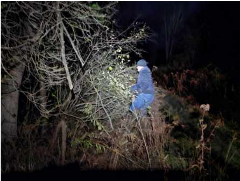
Trimming back trees and brush along trail C7E.