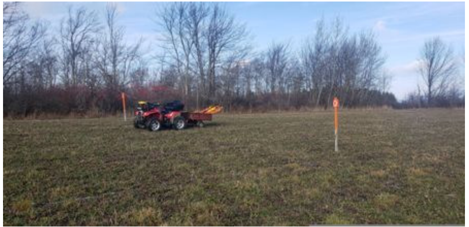
Trail Boss Zach Simeon pounding stakes out in Knox on trail C7B.