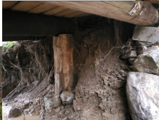
Scotchridge Rd bridge was jacked up and repaired.