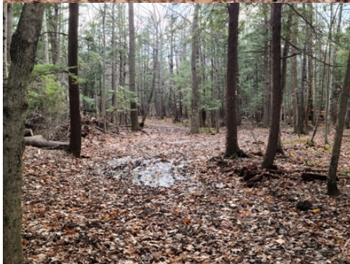
Straight sections will help with big grooming machines, like the PB100 in the Martin woods.

New Route For C7B Completed Work on the trail thru the Martin woods and White meadows has been finished. Signs are up and the old section of trail is closed. The new route is a much straighter and wider path.