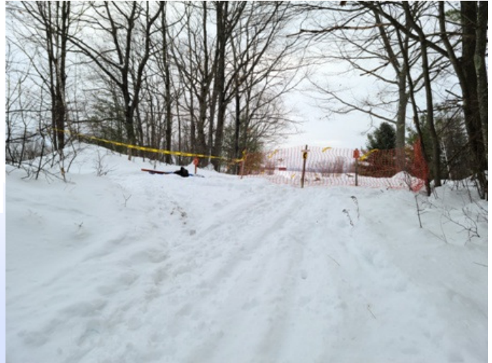
Trail C7B just before Christmas last year.

preparation had occurred after the late bow hunt and before normal snowfall was on the ground. In many cases landowners will not allow trail preparation while deer hunting season is open. Last season Frontier trails opened right after late bowhunting season ended. Snow does fall in December, enough to snowmobile on. Never before has deer hunting and snowmobiling overlapped. DEC says it can occur.