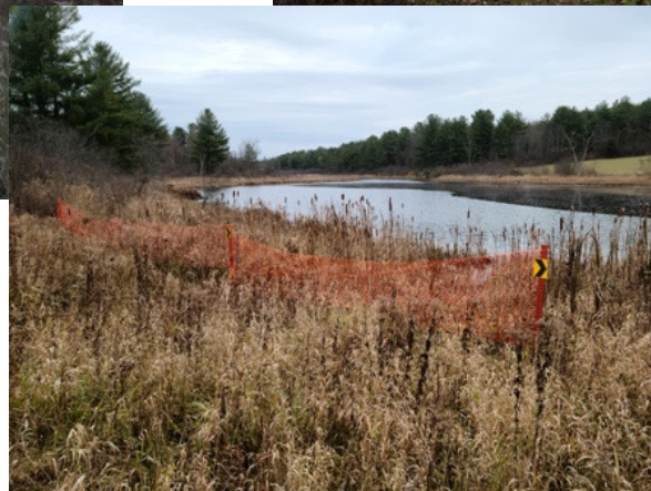
Above, after a long walk to the far end of the runway, signs are going up.

Snow fencing was placed across approaches to the pond below the airport. Beaver are active and the outlet does not freeze over, please stay off the pond and use the highway bridge to cross the water.