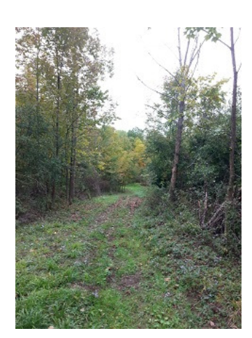
Pics of C7B up near Mariaville.