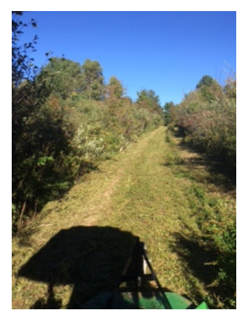
Brush hog work on C7B from Mariaville Peat to North Road.