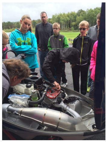
Students take an active part in class.