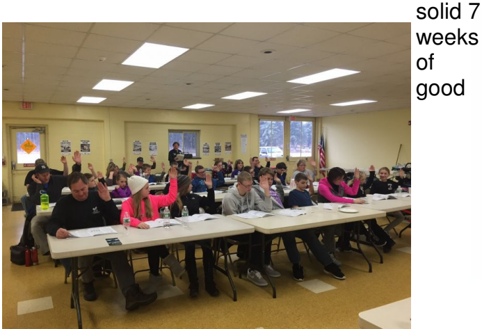
The Safety class 2014-15.

snow around with a blast of cold weather we would have had a great base to kick of the riding season. The month of December and mid-January was not looking good for riding in our area with every storm staying south or on the coast line and missing us. Finally we were able to receive some white gold in our area to be able to open the trails for grooming / riding and with the cold weather it was able to give us a