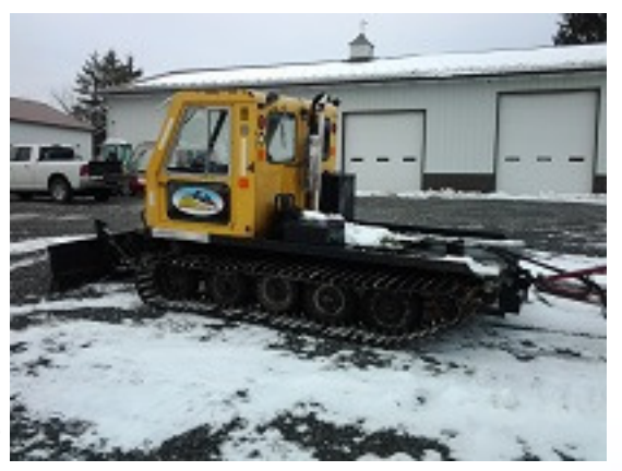
Bombardier Ski Dozer.

no frost in the ground to hold the snow longer before it all melted away. If only we were able to hold that