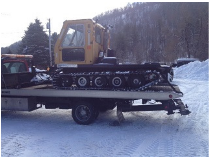
Moving the Bombi around to different locations is made easier with Karl Pritchard's flatbed truck.