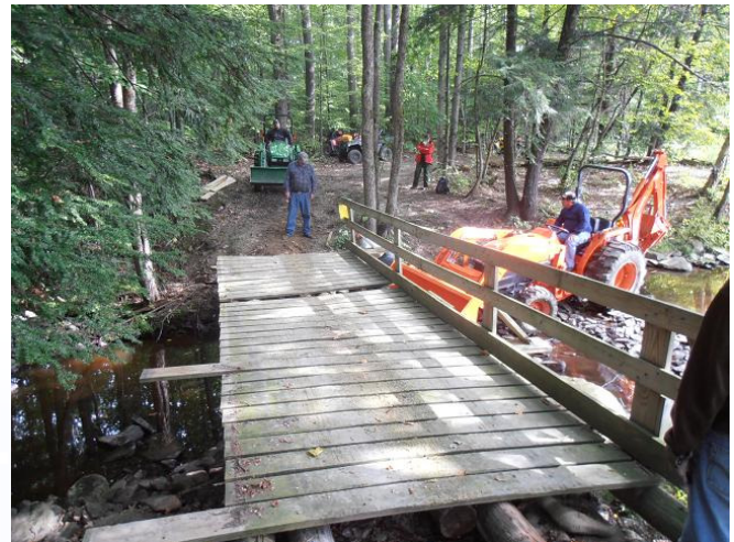
With the beams in place, new decking was installed.

September 7 2013 a work party convened at the end of Spook Hollow Rd. 7 members, 2 of whom were all the way from Connecticut, were joined by the landowner and a forest ranger. The only one missing was the person responsible for the trail damage. He was a no show.