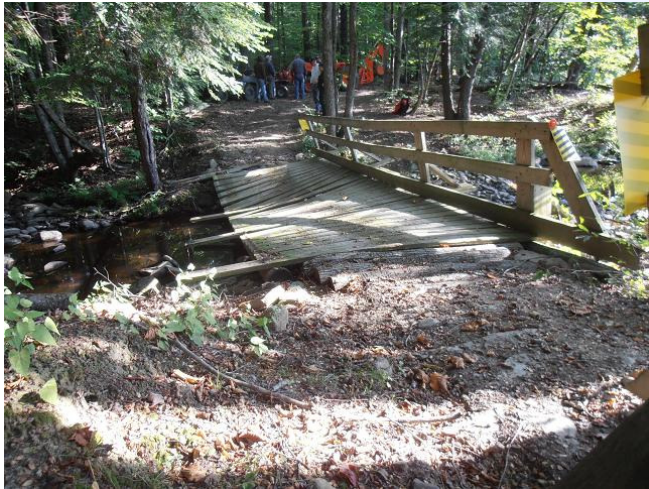
With the downstream railing removed, the damage to the bridge on C7B can be seen.

Over this past summer a section of C7B outside of Mariaville was the scene of a transgression. Liberties were taken and damage to both the trail and a bridge resulted. A person was charged. The Club came together and worked to right this wrong.