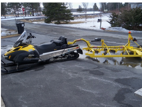
The 2013 Skandic and brand new drag with wheels is ready for its first run in the snow!

The 2002 Skandic has been in the shop (Mariaville Motorsports) running down electrical gremlins.