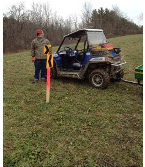
Berne/Knox area