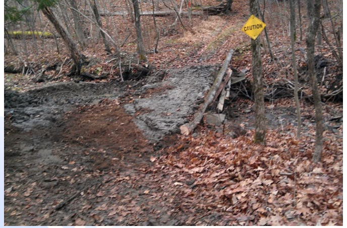
Jack Dowling works on Trail C7E below Acorn Drive in Delanson. This work will provide a safe and smooth ride through the woods.