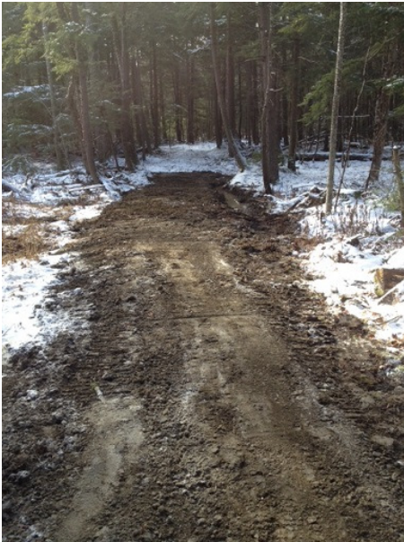
Left, Trail C7B has been raised with fresh fill brought in to remove a mud hole area.