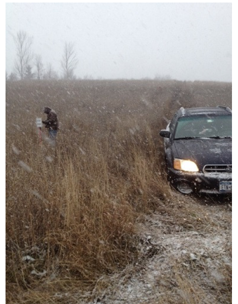
Right, The snow is flying as the trail signs are going up. Trail boss Brian Buchardt gets around in that Baja.