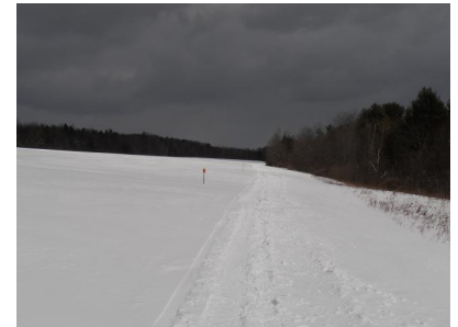
Smooth conditions at the Blue Heron Airport.