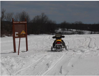
Junction of C7B and C7E, near Chadwick/Knox Cave Rd.

While all but the northern area of Frontier trails were closed, I rode out to inspect the central area to see what conditions were like. I also wanted to be able to say I had ridden Frontier trails in mid March! The pictures tell of the conditions I found.