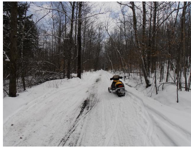
S70 to Duaneburg near junction with C7B.