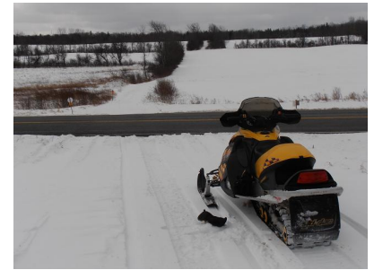
C7B crossing the Schoharie Turnpike.