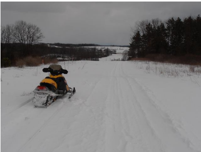
On the pipeline above Rt146, C7B, near Gallupville.