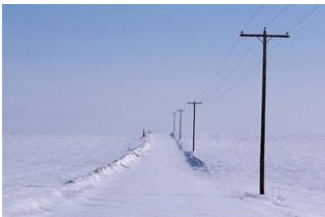
It does kind of look like Gage Rd in Knox...

In 2001 over 100" fell in the hill towns, making for some great riding all season long.