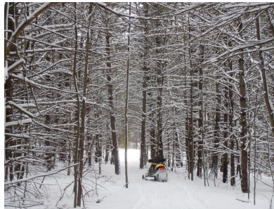
In the woods alongside the pipeline, snowy limbs.