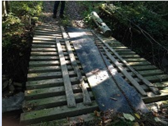
At left the old bridge on C7F near Ragan Rd.