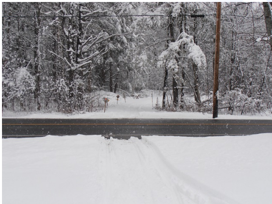
C7B road crossing in the State Forest.

The way is twisting, making a large switchback to keep the elevation change mostly gentle. There is a nice mix of fields and woods. For a stretch the trail follows a National Grid power line.