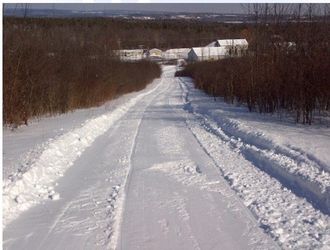
Wide trail S70 in Albany County.

Simply widening the trails will allow for larger grooming equipment. Large groomers pull drags that cover more