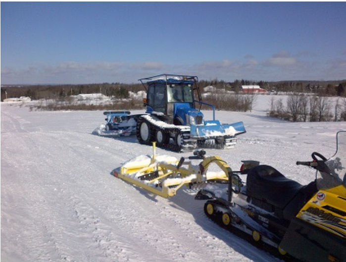
A Skandic groomer, in foreground, and the New Holland groomer on trail C7B in Albany County. A true case of size does matter!

The Club will need your help to make this happen. From our landowners to the regular club member, all will need to be involved for this to occur.