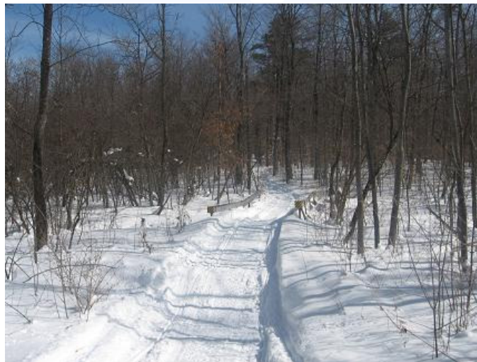
Narrow trail C7B in Schenectady County.

With the recent news of new groomer equipment coming to Frontier Sno Riders, there will be a need to improve the trail. The riding experience on both C7B and C7E in Schenectady County will improve with the upgrade.