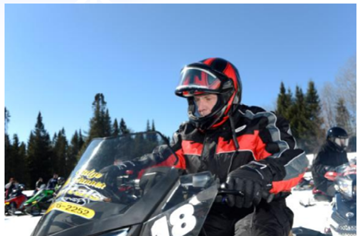
Governor Andrew M. Cuomo snowmobiling near Lake Clear,

"New York is home to some of the best winter resorts in the world, and with more operating ski areas than any other state in the nation, the region is the perfect winter getaway," Governor Cuomo said. "With some of the best ski slopes, snowmobiling tracks, hiking trails, and scenic views, we want New Yorkers to know they should stay in New York and all out-of-state visitors to feel welcome to partake in all that Upstate has to offer."